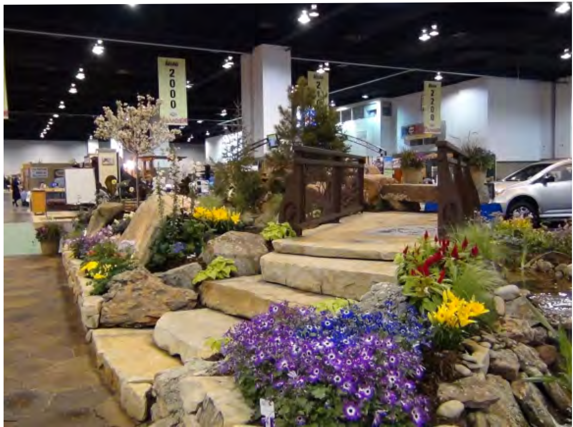
Exhibit Hall A is the only hall equipped with programmable lighting for use in general sessions. The meeting rooms and ballrooms also have programmable lighting. There are four separate scenes to create different settings including bar lights for a general wash on the podium and head table area.